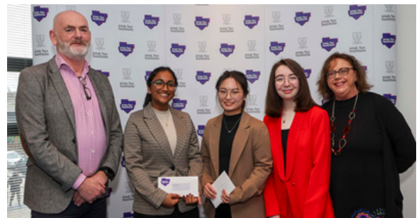
The Fantasy Budget 2024 winning team from Trinity College.