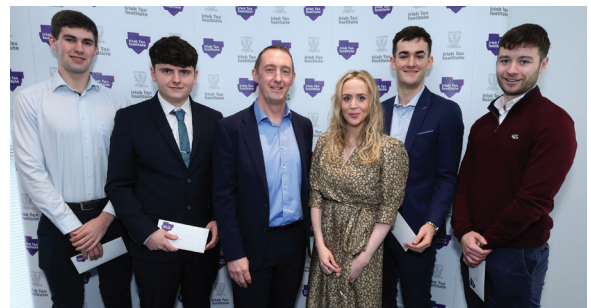
The Fantasy Budget 2023 winning team from University College Dublin.